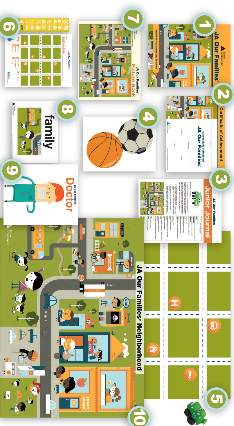
1 JA Our Families® Neighborhood Map

This program focuses on the roles people play in their local economy and shows children the importance of work and the skills that are required to get—or earn—what they need and want. Selected materials from the program are featured below.